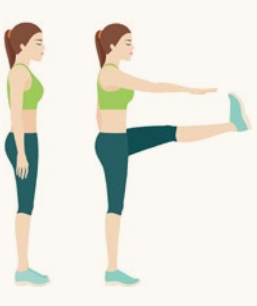
Leg swings x 10 each direction